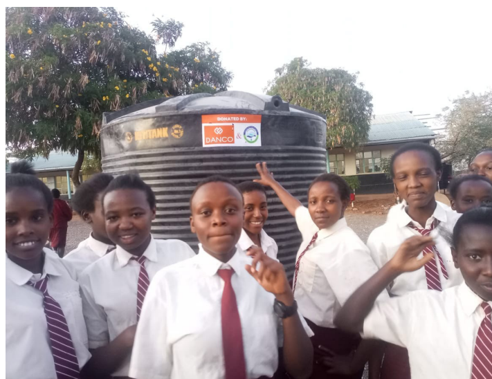
Students of Ilbissil Girls Sec· Sch receive a tank·

In the spirit of Public-Private-Partnerships, the Agency partnered with Danco pipes in February, 2023 to donate a 10,000-liters plastic water storage tank to Ilbissil Girls Secondary School in Kajiado County.