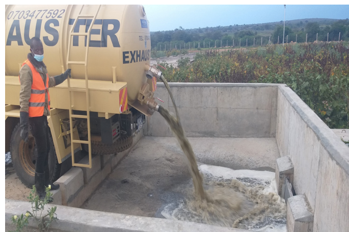
Exhaust discharge bay

Maturation ponds are included for additional removal of organic matter and other pollutants. They are designed shallow with large surface area to allow more oxygen to dissolve into the water thus giving the bacteria enough oxygen to properly function. In these ponds, sludge accumulation is very low. The shallow ponds benefit from high photosynthetic activity arising from the penetration of solar radiation. The shallow ponds allow sedimentation to take action. These ponds are only included in the treatment line when high efficiencies of pathogen removal are required, either for discharge of the treated effluent in surface water bodies, or for use for irrigation or aquaculture. Maturation ponds may be used in combination with a rain water reservoir to form an ecological, self-purifying irrigation reservoir.