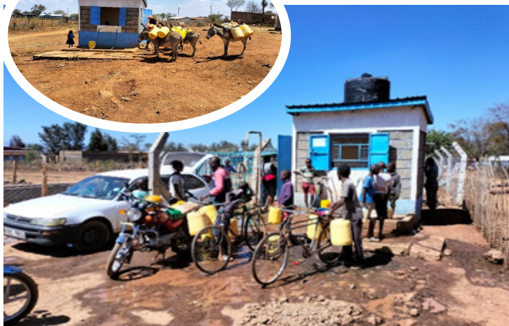
Emining water kiosk

Chemususu Water Supply and Distribution Project in Eldama Ravine mirrors success with thousands of beneficiaries ranging from hospitals, schools, market centers and homes in some parts of Eldama Ravine, Mogotio and Rongai Towns.