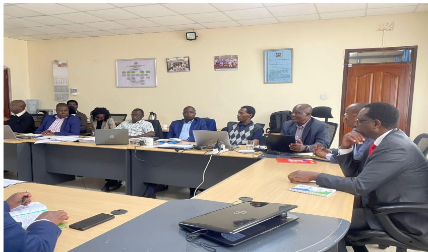
The joint inter-ministerial technical taskforce meeting at the Agency during evaluation of initial works of Itare Dam