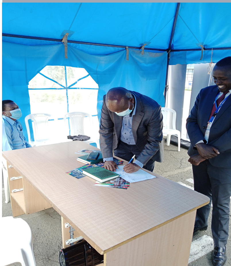
General Manager- Corporate Services registers his visit to Britam's Group Marketing activation held at the Agency.