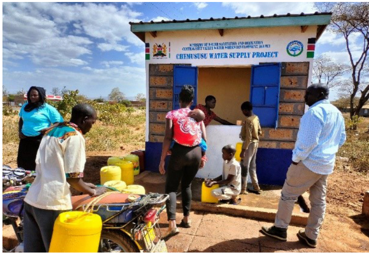
Mogotio, Ministry of Water Kiosk

M irage on tarmac, high temperatures and clear fields defined our tour to Baringo County over the month of December 2022. Popular empty Jerrycans on peoples' hands and donkey carts led us to a shopping center where the scarce commodity was available. Clearly, the dry season was officially on and the usual struggle for water was evident.