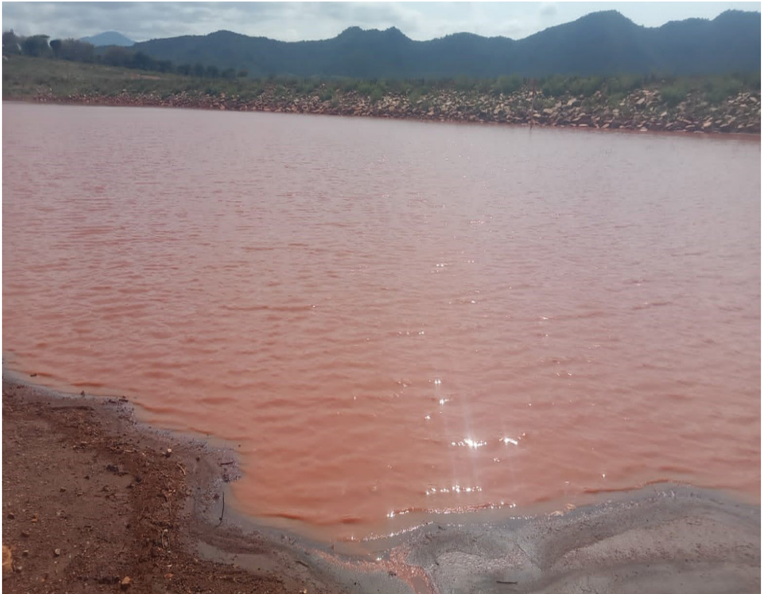
A section of Kases Peace Dam