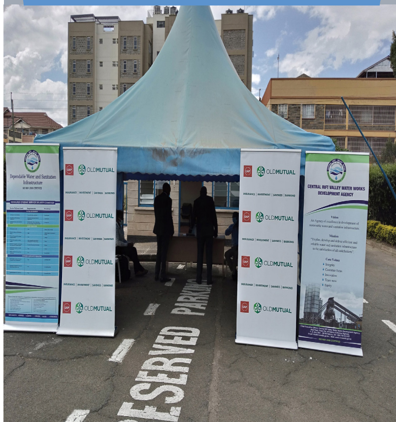
CRVWVDA hosts Old Mutual for a financial management sensitization